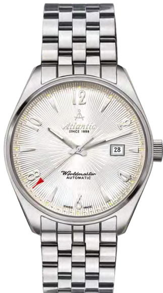
51752.41.25SM | Automatic