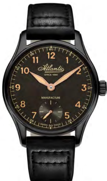
52952.46.63R with black leather strap