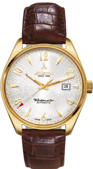
51752.45.25G | Automatic 51651.45.25G | Mechanical