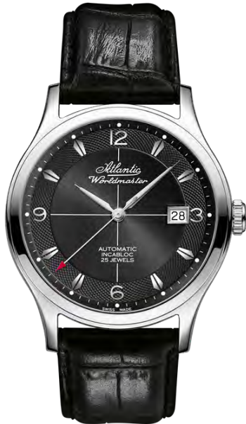
53754.41.65S | Automatic