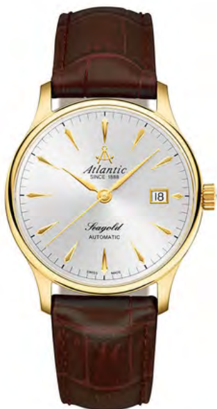
95743.65.21 | Automatic