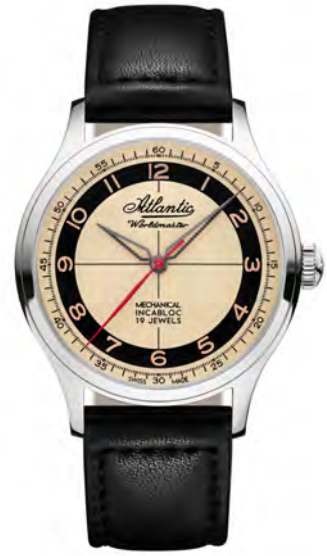
53680.41.93 | Mechanical