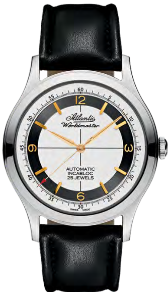
53754.41.25G | Automatic