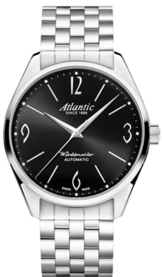
51752.41.69SM | Automatic