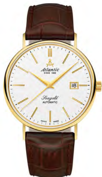
95744.65.11 | Automatic