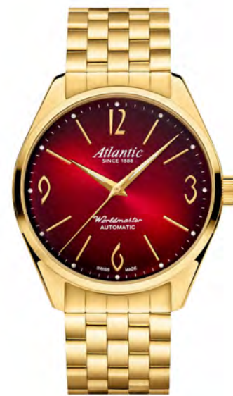
51752.45.99GM | Automatic