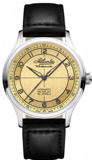
53780.41.39BK | Automatic