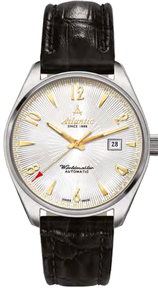
51752.41.25G | Automatic 51651.41.25G | Mechanical