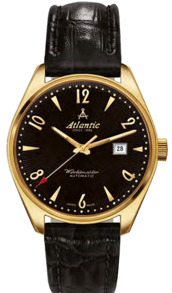
51752.45.65G | Automatic