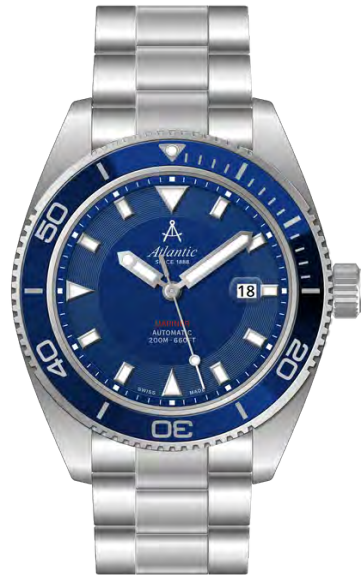
80776.41.51 | Automatic