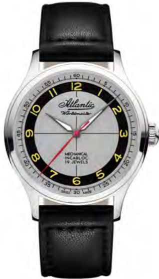
53680.41.23 | Mechanical