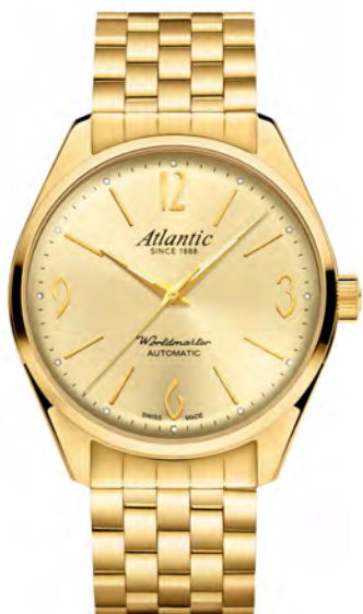
51752.45.39GM | Automatic