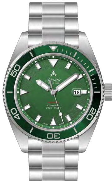
80779.41.71 | Automatic