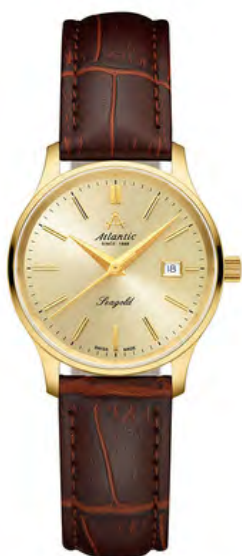
94342.65.31 | Quartz