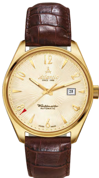
51752.45.35G | Automatic 51651.45.35G | Mechanical