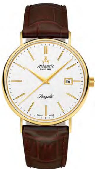
95344.65.11 | Quartz