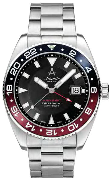
80575.41.61 | Quartz GMT