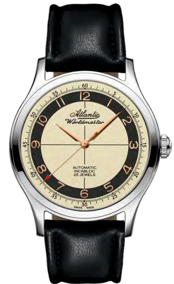
53754.41.93.RBK | Automatic