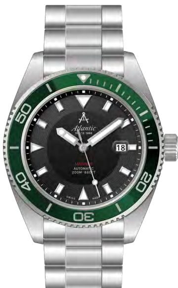
80779.41.61 | Automatic