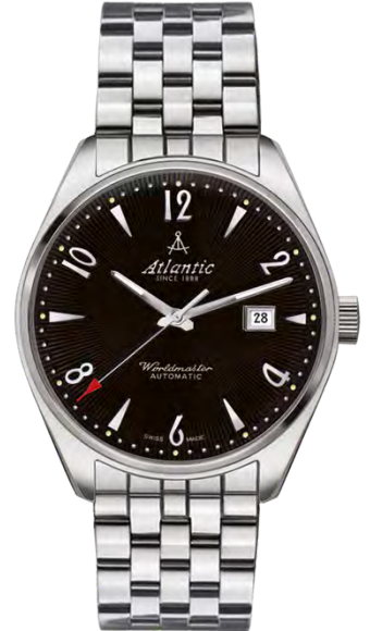
51752.41.65SM | Automatic