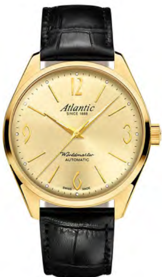
51752.45.39G | Automatic