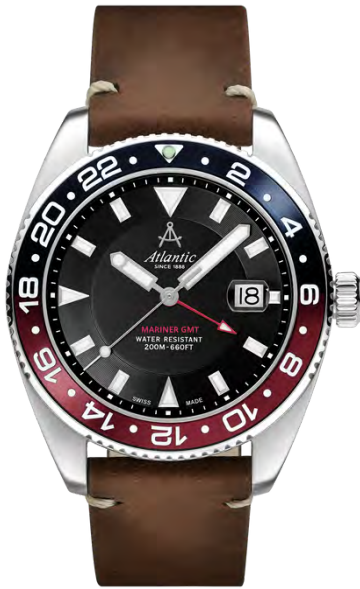
80570.41.61 | Quartz GMT