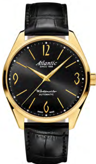
51752.45.69G | Automatic