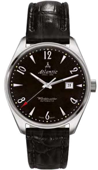
51752.41.65S | Automatic 51651.41.65S | Mechanical