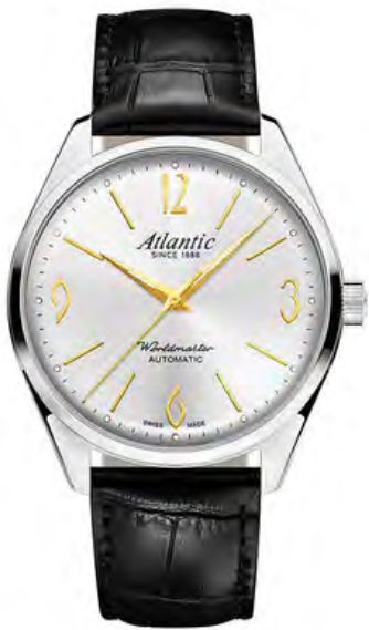
51752.41.29G | Automatic