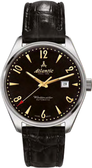
51752.41.65G | Automatic 51651.41.65G | Mechanical