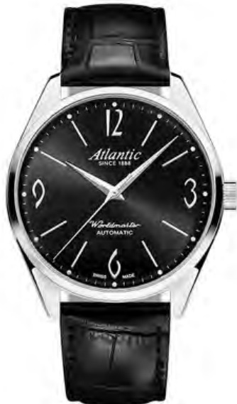
51752.41.69S | Automatic