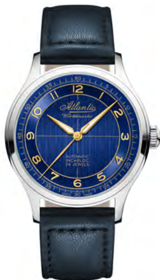
53780.41.43R | Automatic