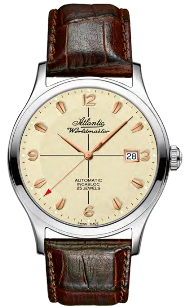
53754.41.95.R | Automatic