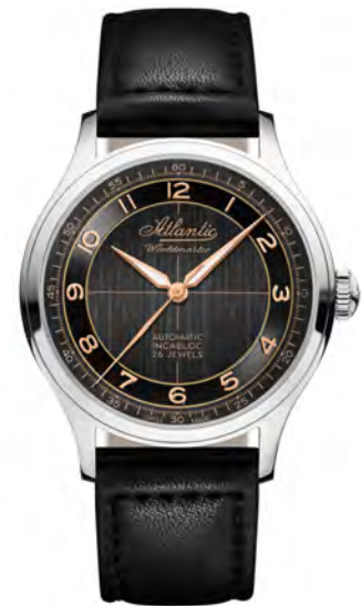
53780.41.53G | Automatic