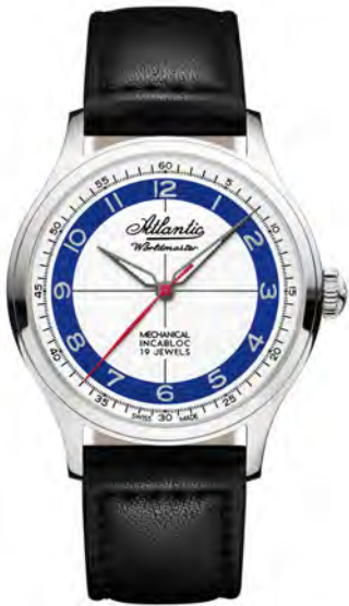
53680.41.13 | Mechanical