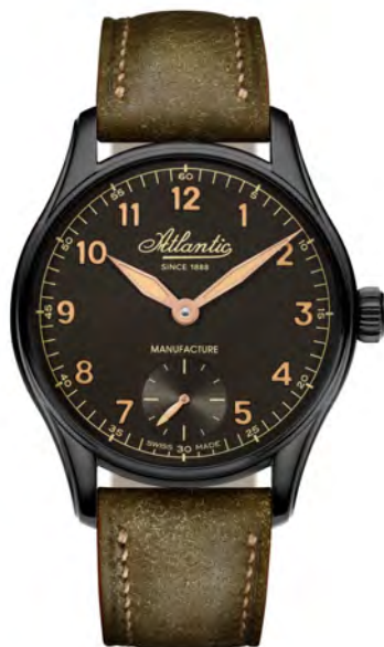
52952.46.63R with second leather strap