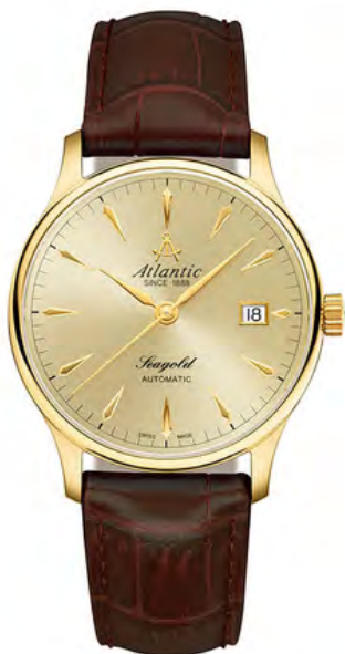
95743.65.31 | Automatic