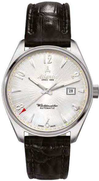
51752.41.25S | Automatic 51651.41.25S | Mechanical