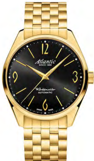
51752.45.69GM | Automatic