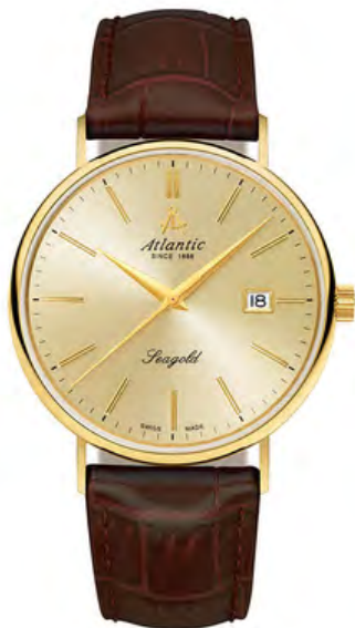
95344.65.31 | Quartz