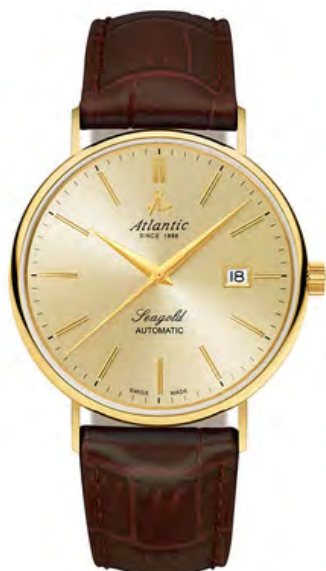
95744.65.31 | Automatic