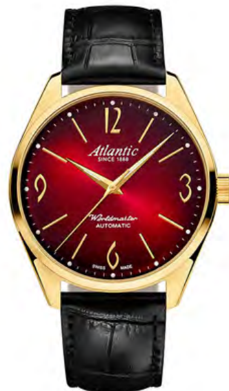
51752.45.99G | Automatic