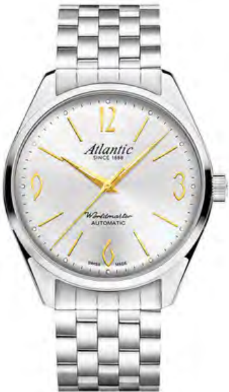
51752.41.29GM | Automatic