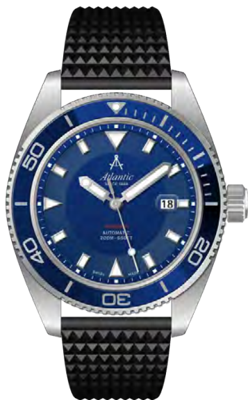
80771.41.51PU | Automatic