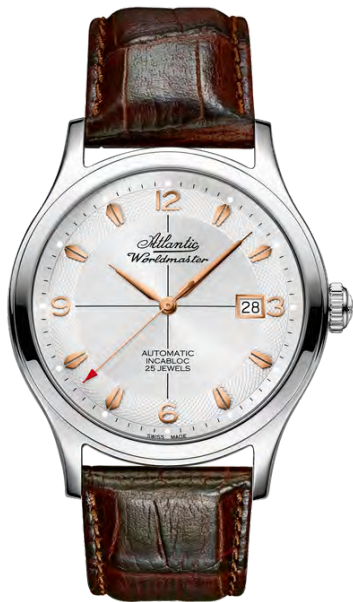
53754.41.25R | Automatic